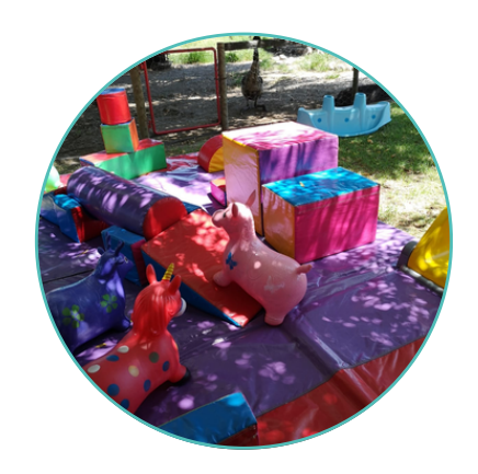
Söft play (Outdoor venue only) R600